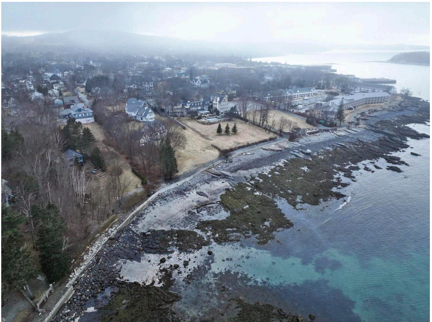
The Shore Path traverses private land along Frenchman Bay.